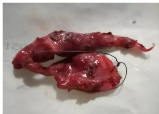
Figure 3: Resected common bile duct cyst & gallbladder.

Thus the final diagnosis with acute pancreatitis with Choledocholithiasis caused by choledochal cyst type 1b was made. Fluid resuscitation was given initially due to profuse vomiting. Other treatment included parenteral antiemetic, proton pump inhibitor, opiate analgesic. After treatment, patient showed significant clinical improvement with decreased frequency of vomiting. Intensity of abdominal pain was also decreased. She was planned to undergo definite treatment by surgery. After complete resolution of 1 st episode of pancreatitis the patient was operated 2 month later. The cyst was completely excised and cholecystectomy (Figure-3) and hepaticoduodenostomy were performed. Histopathology showed inflamed structure lined with biliary epithelium, free of any malignant lesion. The patient made an uneventful postoperative recovery.